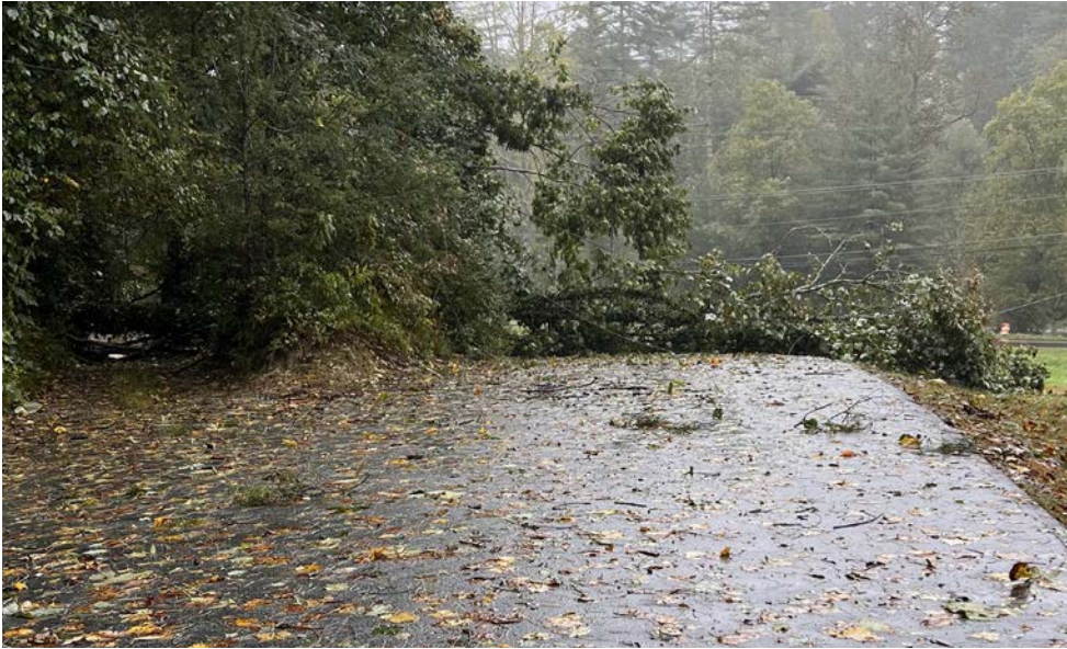
Both entrance roads to CHHS were blocked in the aftermath of Hurricane Helene due to downed trees and power lines.

Folks in western North Carolina will never forget the date of September 27, 2024. That's when Hurricane Helene became the deadliest, and costliest, storm in the state's history. At the Cashiers-Highlands Humane Society, we were lucky. Although our property sustained some damage, including both of our entrance roads blocked by downed trees and power lines, our buildings, staff and animals were unharmed.