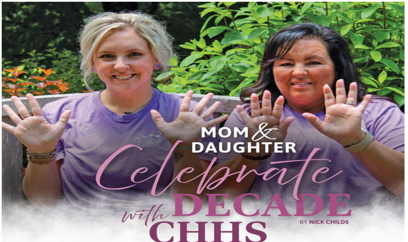
(from the July 2024 issue of Mountain Life Magazine, a publication of The Highlander)